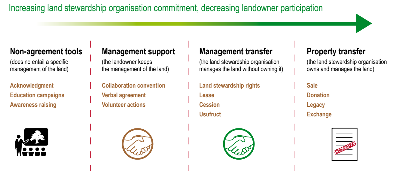
Figure 2. The ladder of land stewardship options and tools

Some other landowners may prefer someone else taking care of their lands whilst retaining the property rights, or the land stewardship organisation may want to undertake their own specialised management of valuable lands. Whatever the reason, the landowner probably desires to maintain and upgrade the value of the estate, and will appreciate a land stewardship organisation taking practical responsibility of its management. Of course, this stewardship organisation should carefully evaluate the challenge of managing a property before accepting, as this may in time become potentially resource consuming.