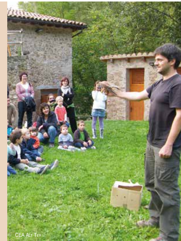
CEA ALT TER

Fundraising so all the activities listed above can be provided by the organisation.