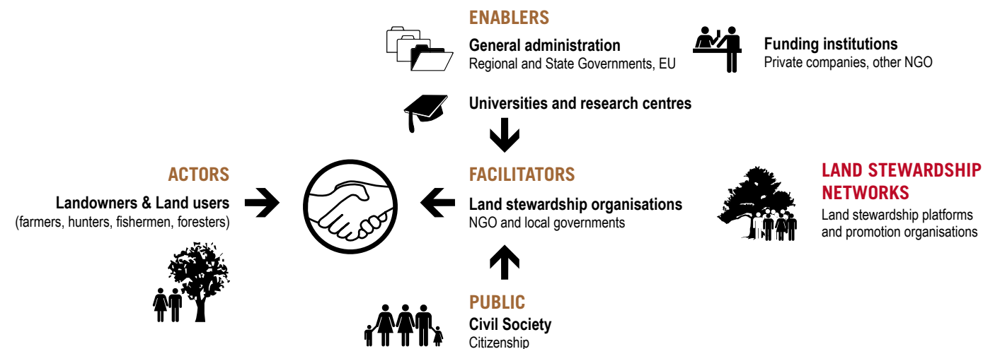
Figure 1. Land stewardship stakeholder model